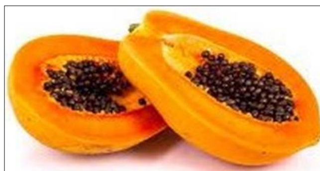
Fig 1: Papaya fruit

Biological source: This is the ripe fruits obtained from plants of species Carica papaya . Belonging to family-Caricaceae.