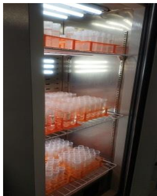
Fig 2: incubator to set culture of Artemia in different temperature.