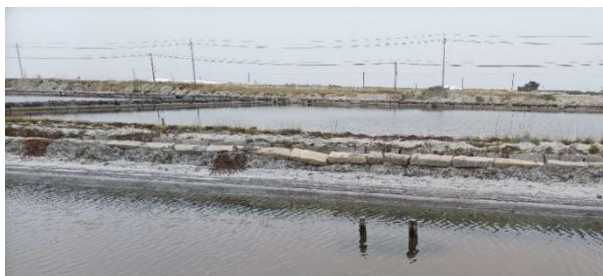
Fig 1: sampling area, Yinggehai Saltern (Ledong, Hainan; 18°31'N, 108°44'E).

The cysts of Artemia were collected from Yinggehai Saltern (YGH), Hainan (18°31'N, 108°44'E) (Fig 1). The natural sea water (35 ppt) was used to incubate cysts for hatching under standard conditions (Sorgeloos et al. , 1986). After hatching, newly hatched nauplii were removed to cylindroconical flasks. The salinity in each medium was gradually increased to reach 80 ppt (Triantaphyllidis et al. , 1995) [12]. Specimens divided to three treatments with different temperature (22 °C, 25 °C and 28 °C). The specimens of each treatments were fed on a mixed diet of the Dunaliella sp. and LANSY ZM (INVE, Thailand) following Triantaphyllidis et al. (1995) [12]. Second generation (only first brood) was used for experiment, (Fig. 2). Individuals of each treatment were transferred into 50-ml falcon tubes containing 35-40 ml of 80 ppt medium before maturation and checked daily. Approximately 15 females were examined for each treatment. The falcons were considered daily at the same period to determine life span and offspring production until death of the female. Significant differences between means of treatments were determined by One-Way ANOVA (Tukey, p < 0.05 ). The program SPSS 16 was used for statistical analysis.