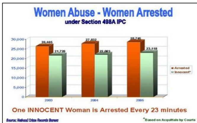
Fig 2: NCRB Data on The Women Arrested Under 498A

In Narender Singh Arora Vs State (Govt. of NCT Delhi) & Ors [4]. Honourable Delhi High Court stated “5. This case is a reflection of mentality which is now taking grip of parents of a deceased wife in the criminal cases. Whenever a woman dies an unnatural death within seven years of her marriage at in-laws’ house, whatever be the cause of death, the in-laws must be hanged. This case also shows how truth is losing significance because of the ego of the litigants to see that in-laws should be hanged.”