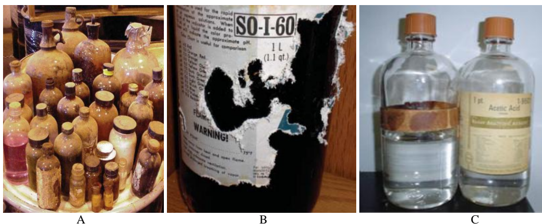
Fig 1: Different unlabeled chemicals. (A) Concealed, (B) deteriorated, and (C) unreadable.

Most of these materials represent as unknown materials which should identify properly. These unidentified chemicals are unhallowed to be transported, stored, or disposed as waste unless they identified [4] Unknown chemicals present serious legal and safety problems for the university, the process of disposal became very dangerous and chemical should be first identify before disposal. Consequently, some of these items may be unlabeled, or their labels may be deteriorated, or become covered or unreadable, or was improperly labeled, as shown in figure (1). All are considered as unknown.